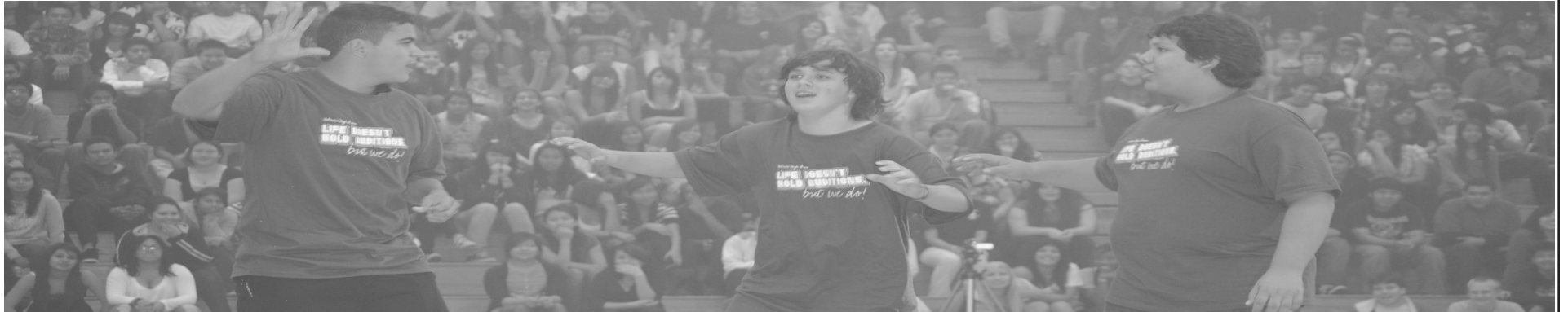
Comedy Sportz Performing At the The Assembly