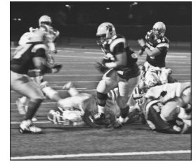
PAGE 12 HOME-COMING GAME

PLACENTIA'S OLDEST CONTINUOUSLY RUNNING NEWSPAPER, EL TIGRE IS A STUDENT-RUN NEWSPAPER IN THE PLACENTIA-YORBA LINDA UNIFIED SCHOOL DISTRICT